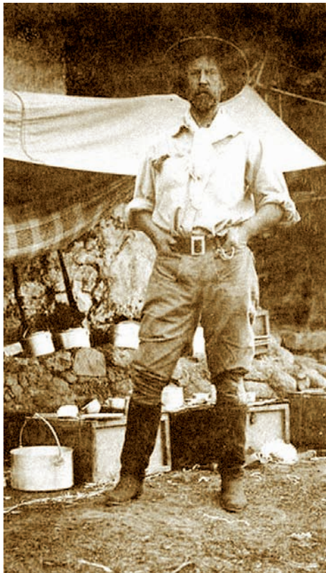
Percy Fawcett, model for Lord John Roxton

Sir Arthur Conan Doyle is of course famous for the creation of Sherlock Holmes, the detective who applied science to the solving of crimes. Less well known are his Professor Challenger stories - The Lost World (1912) The Poison Belt (1913), The Land of Mists (1926) - in which the central character is a great scientist and the subjects and themes largely scientific.